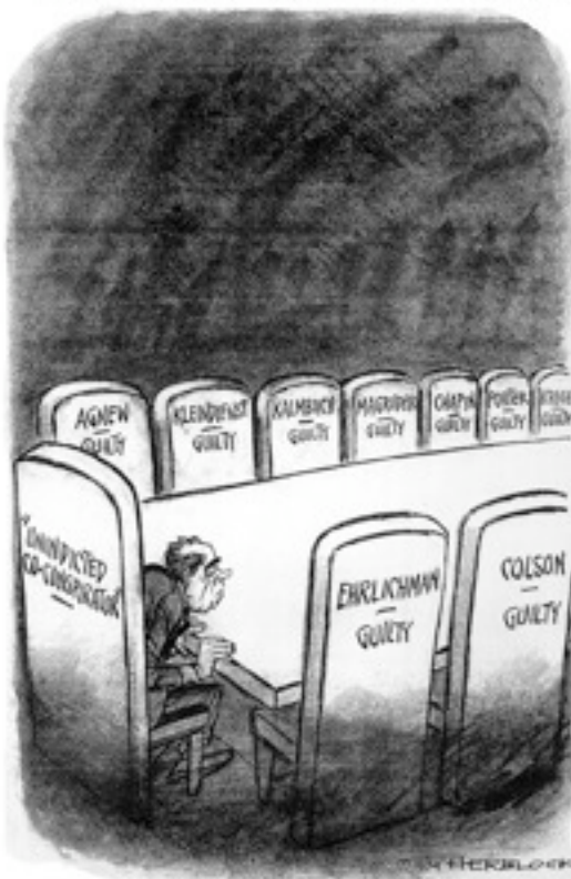
Cartoonist: Herbert Block (1909 - 2001)