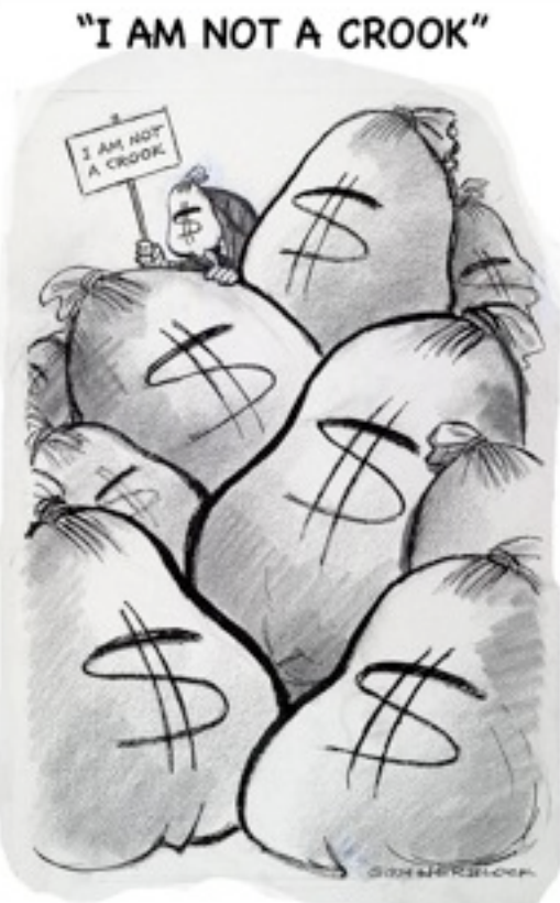
Cartoonist: Herbert Block (1909 - 2001)

Four months later an IRS investigation revealed that Nixon owed $433,000 in back taxes.