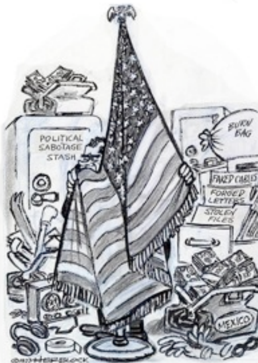
Cartoonist: Herbert Block (1909 - 2001)