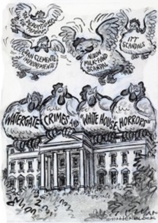
Cartoonist: Herbert Block (1909 - 2001)