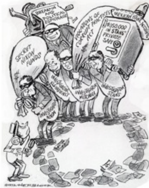
Cartoonist: Herbert Block (1909 - 2001)

"THERE'S NO NEED FOR AN INDEPENDENT INVESTIGATION, WE HAVE EVERYTHING WELL IN HAND"